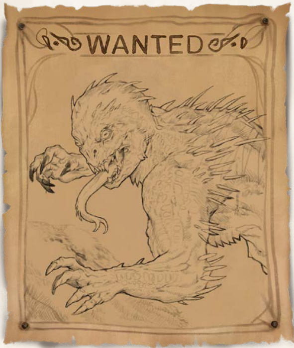
Chupacabra Bounty Poster